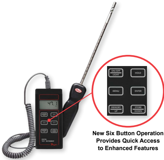
New Six Button Operation Provides Quick Access to Enhanced Features