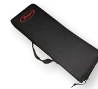
Soft Carrying Case Included with Every Unit