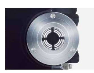
Bidirectional flow measurement The newly developed measuring method allows extremely precise, bidirectional flow measurement with low measuring resistance.

Simple operation CITREX is simple and intuitive to operate. The colour screen offers excellent readability and can be adapted to any situation due to its flip-screen function.