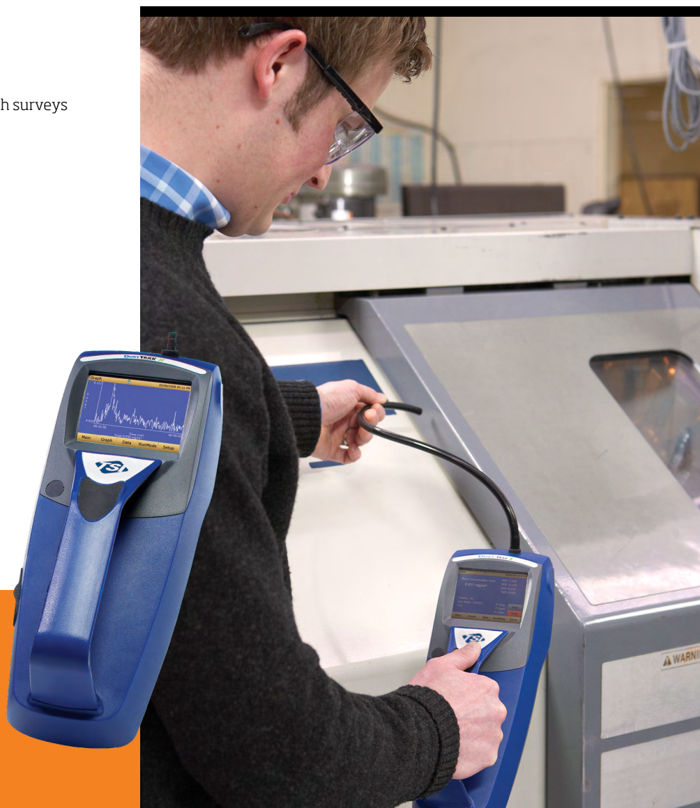
Handheld Monitor, Model 8532

TrakPro™ Data Analysis Software allows you to set up and program directly from a PC. It even features the ability for remote programming and data acquisition from your PC via wireless (922 MHz or 2.4 GHz) communications or over an Ethernet network. As always, you can print graphs, raw data tables, and statistical and comprehensive reports for record keeping purposes.