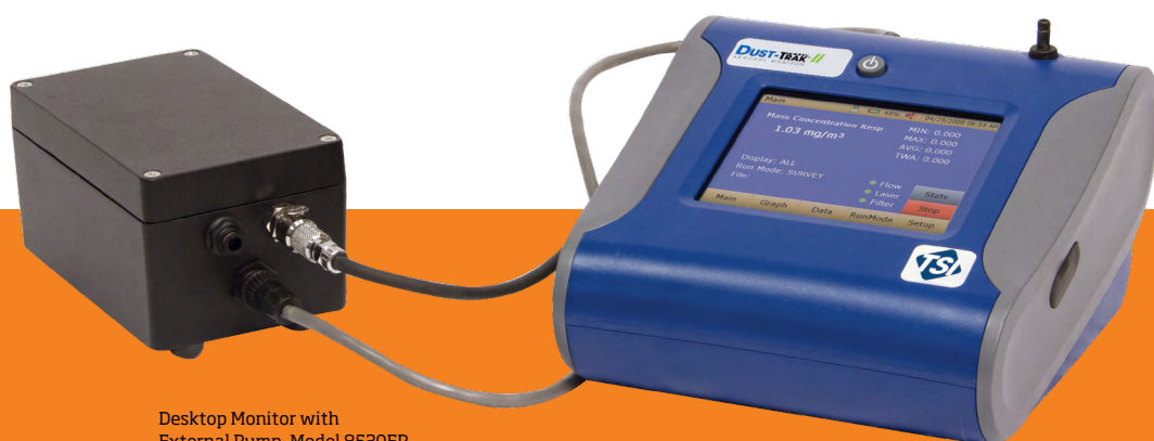
Desktop Monitor with External Pump, Model 8530EP