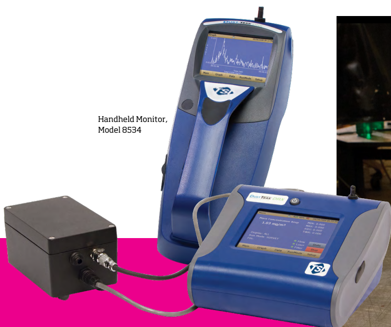
Desktop Monitor with External Pump, Model 8533EP