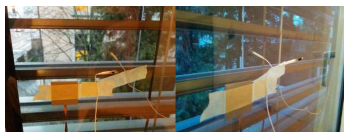
Figure 1: Measurement set-up: Window with metal exterior shutters; Heat flux sensor with 2 temperature sensors, one inside and one outside, both roughly 2 cm away from the glass.

The night measurements were all started a couple of hours after sunset and stopped early in the morning (to be in line with ISO 9869). The third measurement was stopped right after sunset but this did not have any influence on the measurement outcome. The day measurement has been started in the morning and stopped at the beginning of the evening before sunset. During the measurement there was no activity in the room. The measurements were evaluated with the greenTEG Software (V1.00.03).