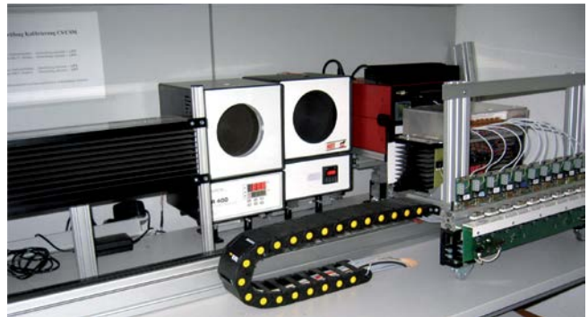
Automated calibration stations at Optris GmbH

Based on the LS-PTB, Optris produces the LS-DCI as a high-precision reference IR thermometer for its customers. The DCI units are produced with pre-selected components supporting a high stability of measurement. In combination with a dedicated calibration at several calibration points the LS-DCI achieves a higher accuracy than units from series production.