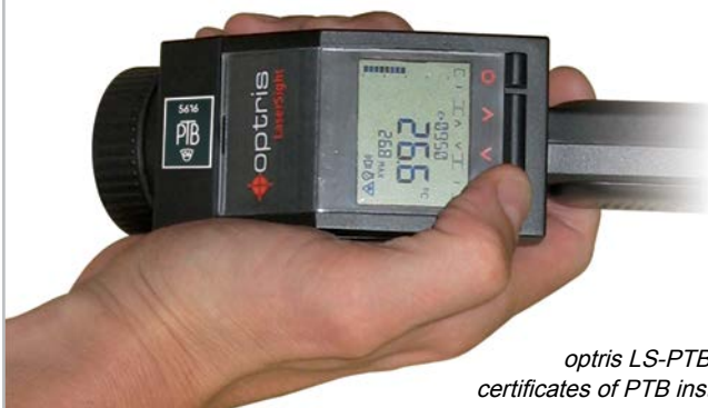
optris LS-PTB and certificates of PTB institute

Optris GmbH has up-to-date in-house laboratories which fulfill the mandatory requirements for calibration stations. When issuing calibration certificates it is not only the laboratory temperature and humidity that is documented but also the measurement distance and source diameter (calibration geometry).