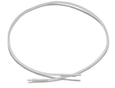
Figure 2 Nafion® Membrane Tube, part no. 212807GM

The Nafion® membrane tube removes water, alcohols, ammonia, amines, and other compounds having a hydroxyl group or potential for forming one under acid catalysis. Some compounds are not removed but are rendered by acid catalysis. Inorganic compounds are not normally removed, except water and ammonia. The CO<sub>2</sub> content of the gas sample is not affected. However, note that water removal from the gas sample results in a higher CO<sub>2</sub> reading due to increased partial pressure of CO<sub>2</sub> in the dried gas.