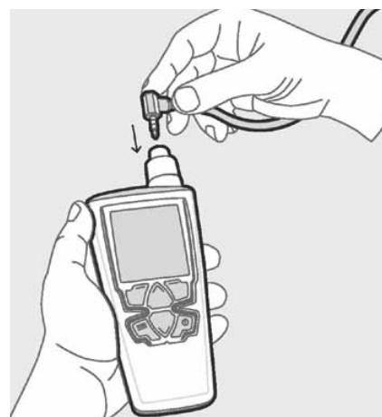
Snapping a connector to the indicator HM40 to read the measurement results.