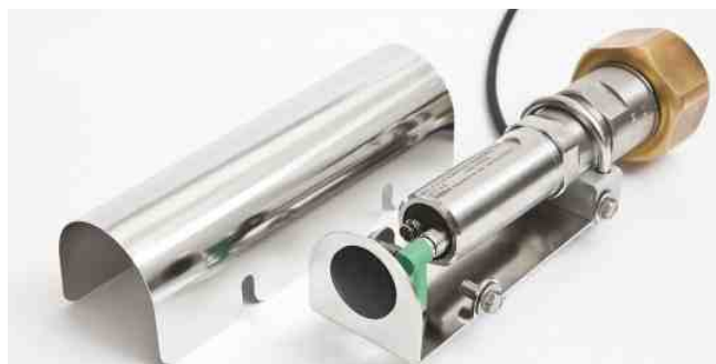
The DPT145 with the weather shield.

Vaisala has over 70 years of extensive measurement experience and knowledge. The DPT145 brings together the proven DRYCAP® dew point sensor technology and BAROCAP® pressure sensor technology in one package, providing an innovative and convenient solution for monitoring SF6 gas.