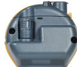
Quikstick ST POL8751, standard with all MMS3 kits and with the same performance as the standard Quikstick. A Quikstick ST can remain connected to the MMS3 while using the pins.

MMS3 may be used with three styles of interchangeable humidity probe, the Hygrostick, the Quikstick and the Quikstick ST. The Hygrostick (grey POL4750) can be used for high moisture applications such as concrete measurement. Quikstick (black POL8751) is a general purpose, fast-responding full range sensor.