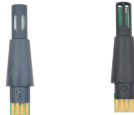
Hygrostick part number POL4750, for high moisture applications.