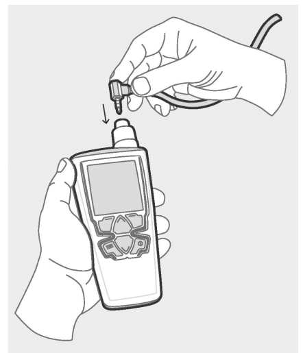
Snapping a connector to the indicator HM40 to read the measurement results.

HMP40S measurement probes are interchangeable. The probes connect easily to the HM40 indicator with a snap-on connector enabling convenient use of multiple probes with one indicator. The measurement data can be displayed in numeric, statistic or graph views.