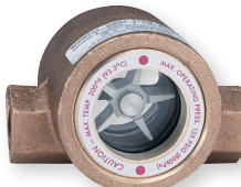
Model 300, 300MP ++