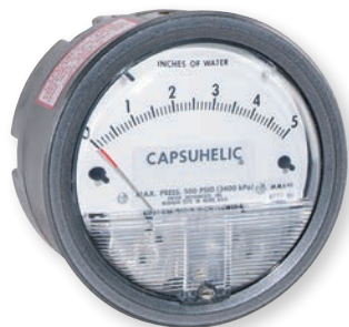
Capsuhelic® Pressure Gage has a large, easy-to-read 4" (102 mm) dial.