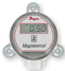
Standard MS with optional LCD