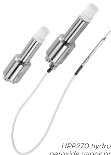
HPP270 hydrogen peroxide vapor probe

Commercial hydrogen peroxide vapor generators are often used in aseptic production and research laboratories to perform bio-decontamination. Most bio-decontamination equipment is handled by skilled operators who are trained to perform and validate bio-decontamination processes. Since the coronavirus pandemic, the need for bio-decontamination increased in sectors where many operators tasked with performing bio-decontamination were not trained in that knowledge area. Without a full understanding of vapor generator equipment, cycle phases,