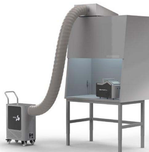
Bioreset® Max connected to BSC

Pietro Beltramo is Amira’s Product and Export Manager and was involved in designing and developing the Bioreset® Max vapor generator. “Our main intention with this new model was to make the generator easy to use. Our other models use different sensors and they do a fine job,” says Pietro. “But the operator should have a working knowledge of bio-decontamination methodologies. We were looking to make vaporized hydrogen peroxide bio-decontamination simple for all users – especially in environments like healthcare. The COVID-19 pandemic made the need for failsafe equipment even more urgent.”