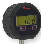
DPG-100 with protective rubber boot