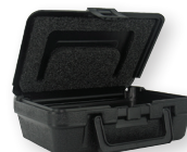
Protective carrying case