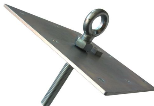
Rooftop holding plate assembly