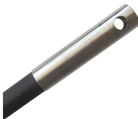
Lower end assembly